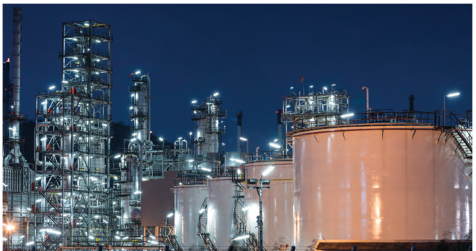
An oil and gas industrial setting where vortex flow measurement plays a key role in monitoring fluid and energy flows

“As end users expand steam measurement and face rising demand for natural gas and other gases, mass flow capability is becoming increasingly critical”