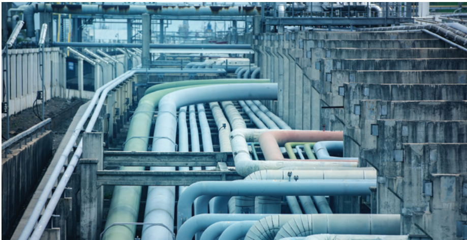
Process industry infrastructure illustrating the environments in which modern flow measurement technologies are widely used