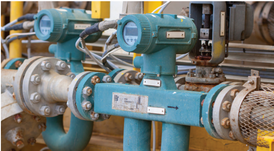
An example of equipment found in applications that rely on accurate and reliable flow monitoring across liquids, gases and steam

multivariable designs, reduced bore meters, plastic body instruments and enhanced digital signal processing.